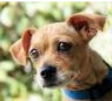
Amber – 3 to 4 years old – Heartworm Positive