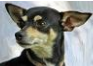
Austin – 2 to 3 years old – Heartworm Positive

HEARTWORM DISEASE Is Life-Threatening MUCH EASIER TO PREVENT THAN TO CURE