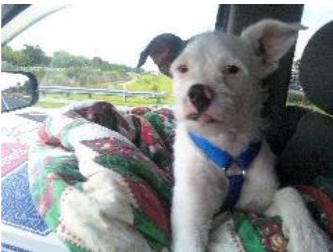
MAXWELL- ABANDONED – LATE 2009 He begins his new life today