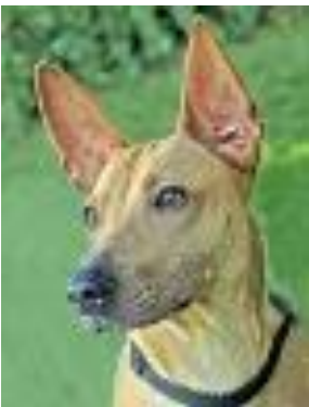
Rey – 3 to 4 years old – Heartworm Positive