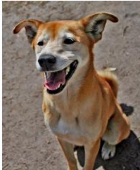
TAZ – ABANDONED – LATE 2008 His new life has now begun

Taz has been a wonderful addition to our family. He fits right in. He is housebroken and walks with pride...as we are proud of him as well. He is a great watch dog, barking at strangers/alerting me when something doesn't sound/smell right to him. Bella, the house cat and Taz had a rough first day but by the 2 nd or 3 rd day, they both settled in and are doing just fine. He has adjusted so quickly and is very comfortable. He visited the local dog park and made lots of new friends. He had his first run on the beach – he is so full of energy but he was so well behaved. He smiles often/loves to please/loves car rides. He is the perfect fit/we have grown very attached to him. It was meant to be. Well worth waiting for as he gives as much joy.